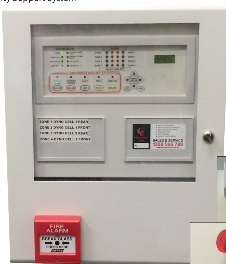
Supervisory Fire Panel

Photos are for representation only, actual product may differ slightly depending on your requirements.