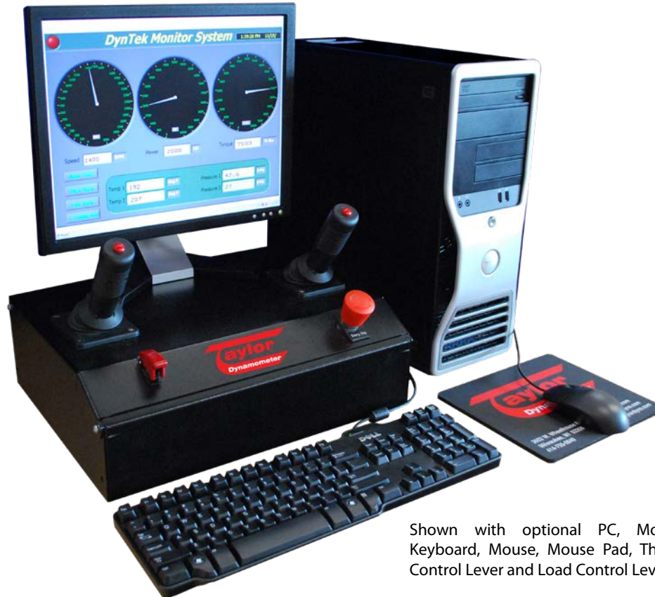
Shown with optional PC, Monitor, Keyboard, Mouse, Mouse Pad, Throttle Control Lever and Load Control Lever.

The DynTek-PC 2+2 engine dynamometer instrumentation system is a display only system intended for the most basic engine dynamometer testing requirements. This system provides for the measurement of torque in either tension or compression (both clockwise and counter-clockwise engine rotation), speed from a standard Magnetic Pickup along with two pressure and two temperature measurements.