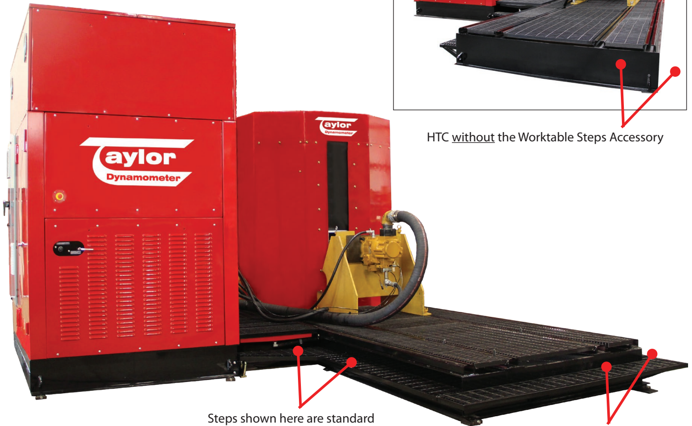
Steps shown here are standard on all HTCs