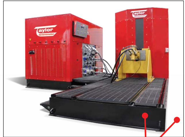
HTC without the Worktable Steps Accessory