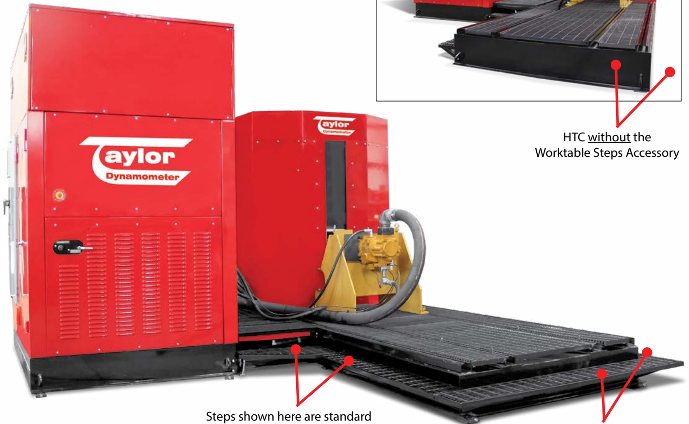
Steps shown here are standard on all HTCs