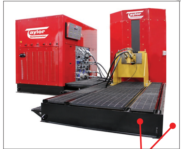
HTC without the Worktable Steps Accessory