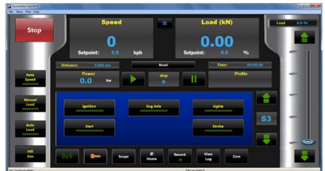
Dyno Function Control Screen