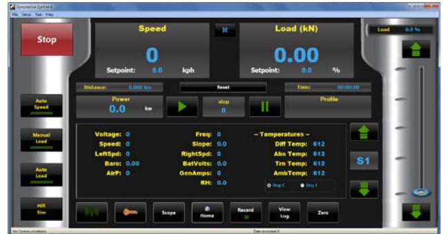
Main Control Screen

Automated tests, data recording and "set and go" controls keeps hands on the wheel and increases testing safety.