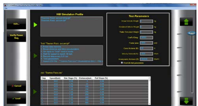
Hill Simulation Menu and Edit Screen