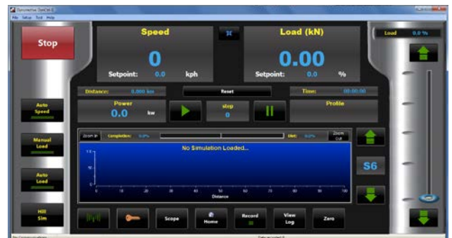
Heads up Display and Driver's Trace Screen