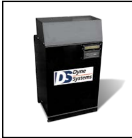
Bulk Fuel Storage and Distribution