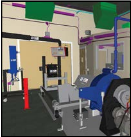
Design, Project & Construction Management Services