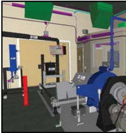
Design, Project & Construction Management Services