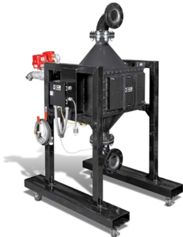
Optional Charge Air Cooler