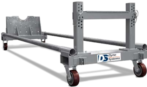
Optional Engine Cart