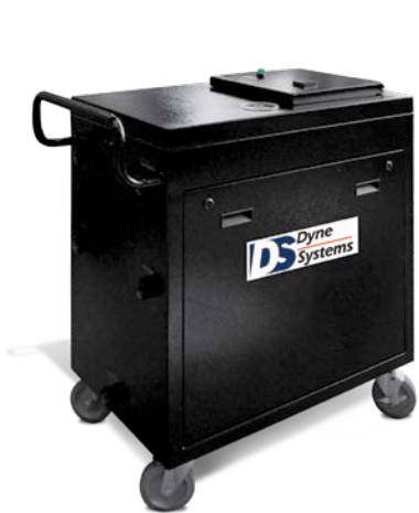
Optional Closed Loop Cooling Center