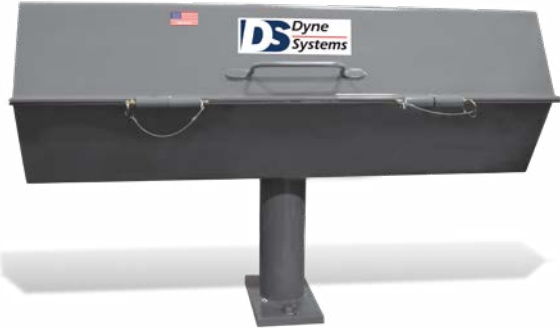
Optional Driveshaft Guard