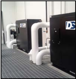
Coolant Storage and Distribution