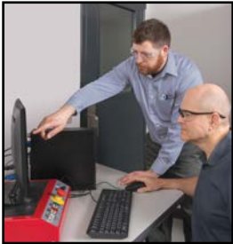
Commissioning, Start-up & Training