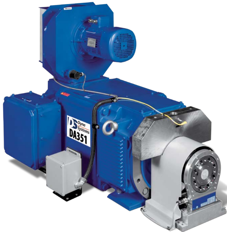
Image shown is for display only, actual DA351 AC Dynamometer may vary.