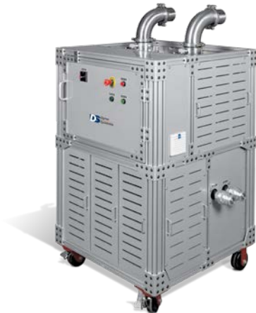
Optional Charge Air Cooler