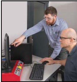
Commissioning, Start-up & Training