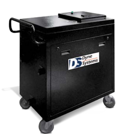
Optional Closed Loop Cooling Center